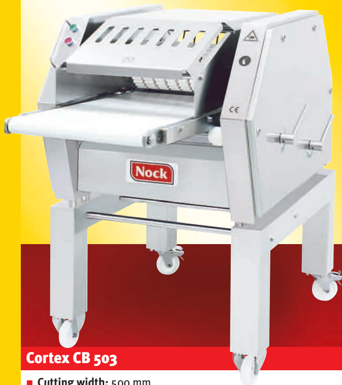
Cortex CB 503

The conveyORIZED NOCK derinding machines for industrial use are equipped with long conveyors and operate with high cutting speeds. They may not be operated in open top (manual) operation.