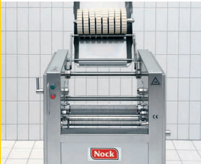
Quick and easy to clean: NOCK derinder after removing conveyor, pressure roller and blade holder. Scraper comb tilted back.

Conveyors, pressure roller, blade holder, exchangeable tables and output sheets can be removed and replaced for cleaning purposes from the machine within seconds without any tools. Therefore soiled parts are easily accessible. The scraper comb can be tilted downwards, the transport roller can be turned by hand. The conveyor frames can be folded back so that the inside of the conveyor can be cleaned. The belts can also be easily removed from the frames for thorough cleaning. The machines can be optionally equipped with plastic modular belts.