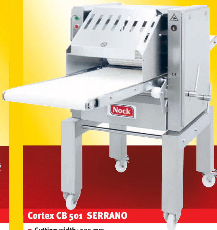
Cortex CB 501 SERRANO