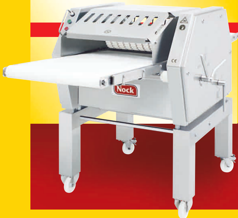
Cortex CB 604 with ASG